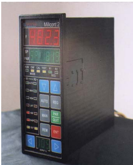
Fig. 3 Microprocessor control module