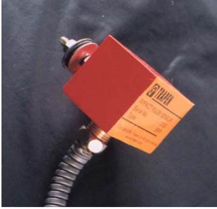
Fig.1 Remote sensor SRIP