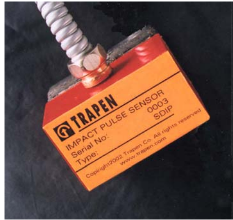
Fig. 2 Direct sensor SDIP